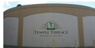
1 M.G. Water Storage Tank

As authorized and approved by EPA, the State has reduced monitoring requirements for certain contaminants to less often than once per year because the concentrations of these contaminants are not expected to vary significantly from year to year. Some of our data [e.g., for organic contaminants], though representative, is more than one year old.